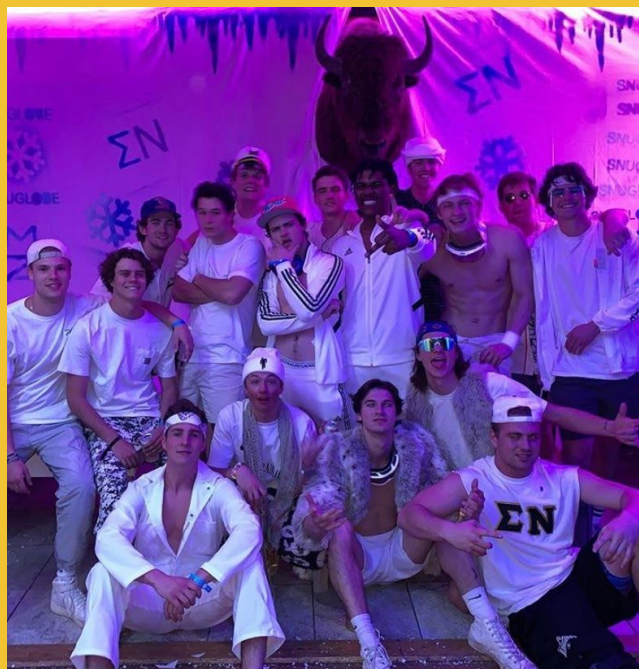
Pictured: Brothers excited and ready for Snu Globe

Snu Globe took at least 1 week to set up. Picture this: A light board for graphic entertainment, a house full of white paper, a room filled with packing peanuts (if anyone wants to go for a swim in the snow), exclusive wristbands that say "SNUGLOBE" given out prior to the event, and ice luges that are engraved with our letters. Both of these parties were advertised a week in advance with our favorite sororities. Wristbands had such a high demand for both parties that we heard stories about girls asking for more than they need and selling them to other girls! Granted, Sigma Nu isn't known for having average parties.