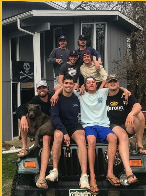
Pictured: Senior brothers enjoying a quarantine graduation celebration

casual poker where cocktails were served, friendly competition engaged, and most importantly, a melting pot where everyone delighted in getting to know each other's family. The weekend continued on Saturday as the boys and their Fathers fired up to play Stanford by attending our tailgate fair and chowing down on a lunch consisting of pulled pork and other tailgate delicacies. Disappointingly, Mother's weekend never came to fruition due to the Global pandemic currently at hand. However, overall, good fun was had, laughs shared, and memories were made, making this year at Gamma Kappa one to remember.